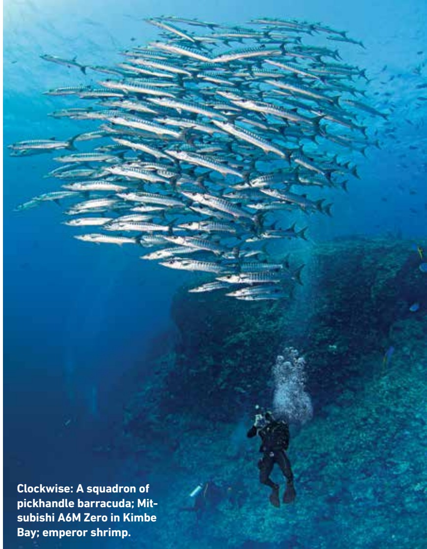
Clockwise: A squadron of pickhandle barracuda; Mitsubishi A6M Zero in Kimbe Bay; emperor shrimp.

From January to March, rains fall on the north coast of New Britain, but the mountain range along the spine of the island keeps the south coast dry. FeBrina operates out of Rabaul for three